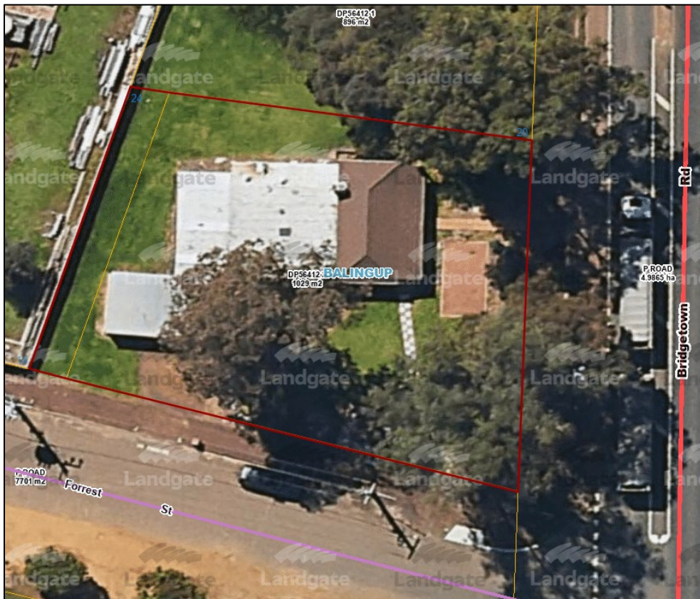
(Lot 2 (No. 24) Bridgetown Road, Balingup)

Lot 2 is 1029m 2 in size and located within the Commercial zoned area along the west side of Bridgetown Road in Balingup and shown in the image below.