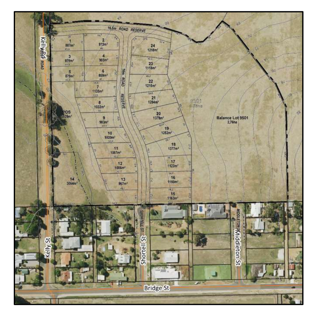
Figure 2 - Approved WAPC Subdivision 158988 of Lot 9501 Kelly Road, in relation to Shortell Street.

The matter has been raised due to an adjoining property owner progressing with an approved subdivision of their property, Lot 9501 Kelly Road (WAPC Approval 158988), as it includes the extension of Shortell Street. During the assessment and subsequent approval of 158988, the Western Australian Planning Commission (WAPC) advised that the formal dedication of Lot 151 on P2170 (Shortell Street) would need to be initiated and completed by the Local Government as is required under the LAA and LAR.