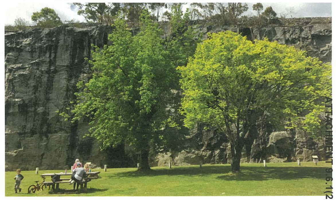
Top left: Baudin's cockatoo. Top right: The Kiosk at the dam, Above: The Quarry, Photos – DBCA