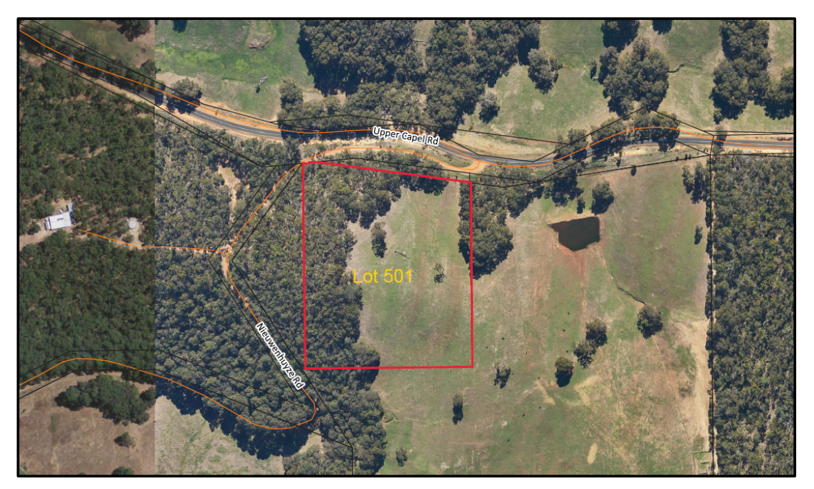
Figure 2 - Lot 501 Nieuwenhuyze Road, Brazier.

The DPLH has asked a series of questions relating to the parcel of land. The proposed tenure arrangement for the lot is "Freehold".