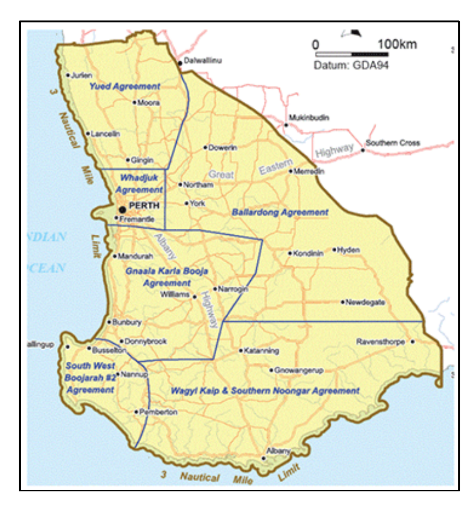
Figure 1 – Map of the South West Native Title Settlement Area and the six Noongar Native Title Agreement Groups that form the six Indigenous Land Use Agreements (ILUAs).

The SWNTS is the largest and most comprehensive agreement to settle Aboriginal interests over land in Australia. The SWNTS area, involving six Noongar Native Title Agreement Groups, is illustrated below.